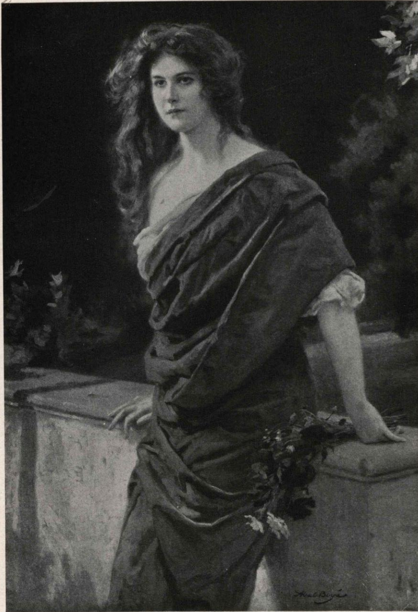
Painting by Abel Boye