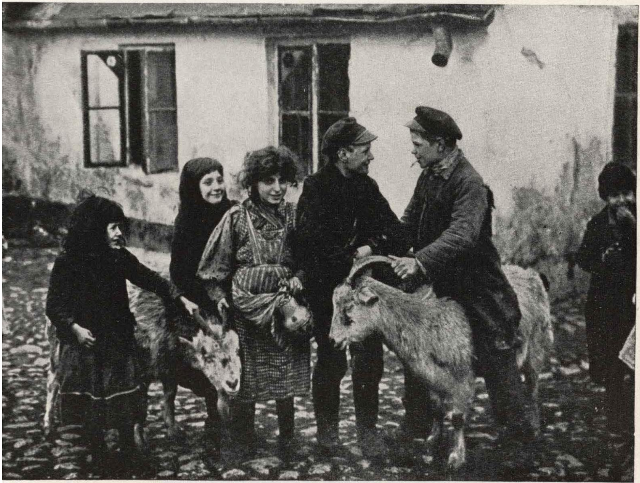
JEWISH CHILDREN IN POLAND

Edwin A. Grovenor, "The Races of Europe," The National Geographic Magazine 34 (December 1918): 505.